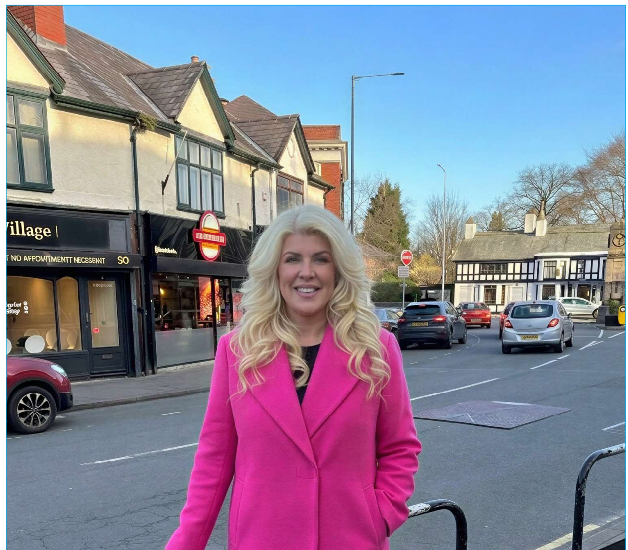
Residents say they want a clear plan to support independent businesses and restore a thriving village centre.

Cheadle and Gatley deserve stronger local leadership, a clear plan, and village centres we can all feel proud of again.