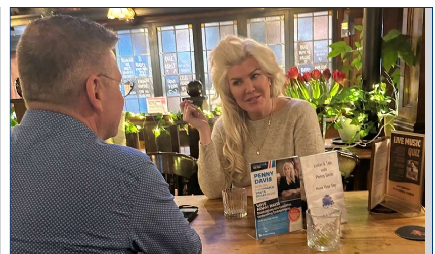
Listen & Talk session at the Red Lion, Cheadle

It is time to demand more and not tolerate mediocrity from the Lib Dem controlled council.